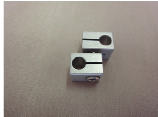
6) The final clamp assembly should look as pictured above and is ready to use again.