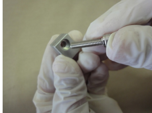
2) Insert the allen screw into the upper clamp. Note that the upper clamp has a large recessed area for the screw head to fit in.