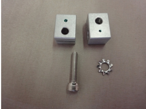
1) The four components of the toggle clamp assembly: the upper clamp, lower clamp, allen screw and lock washer.

When using the facebow, you can accidentally disassemble the toggle clamp assembly. Unless you re-assemble it correctly, the clamp will not tighten around the bitefork and stem assembly. Not to worry though..... the simple steps below show you exactly what to do to get back to work quickly.