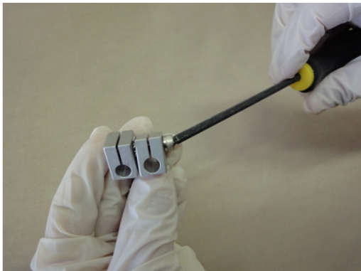
5) Use the allen screwdriver provided to screw the upper and lower clamps together. To prevent damage to the clamps, do not firmly tighten the clamps until the bitefork and stem assembly are inserted.